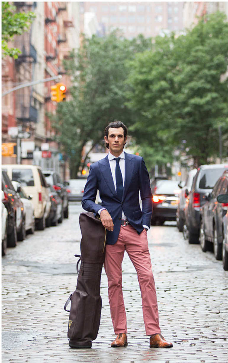
Suit Supply jacket, shirt, tie. AG Green Label trousers. Allen Edmonds oxfords. Douglas Rose golf bag.

When The Dapper Drive was born two years ago, the mission was twofold.